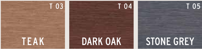
RTO 3 Colors

ta is perfectly protected. Surfaces treated with RTO are water-repellent and free of toxins and allergenic terpenes. (e.g. citrus terpenes, turpentine oil, etc.). RTO contains hydrocarbons free of aromatic compounds, refined natural oils based on soybean, sunflower and rapeseed oil, unleaded driers and natural pigments.