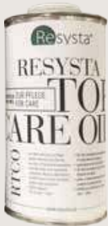
RTCO for maintainance

single work process. In the case of light fading, becoming dull or partial abrasion of the original oil film, RTCO can prevent a complete new treatment of the surface. RTCO contains refined natural oils, soybean, sunflower and rapeseed oil, isolaiphates, wax dispersions, lead-free and barium-free driers.